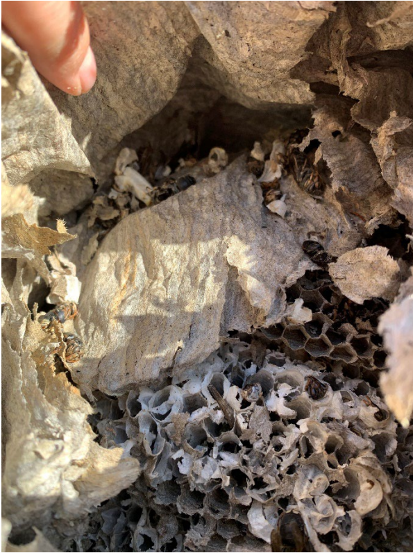
Bald-Faced Hornet Nest – close up exploration