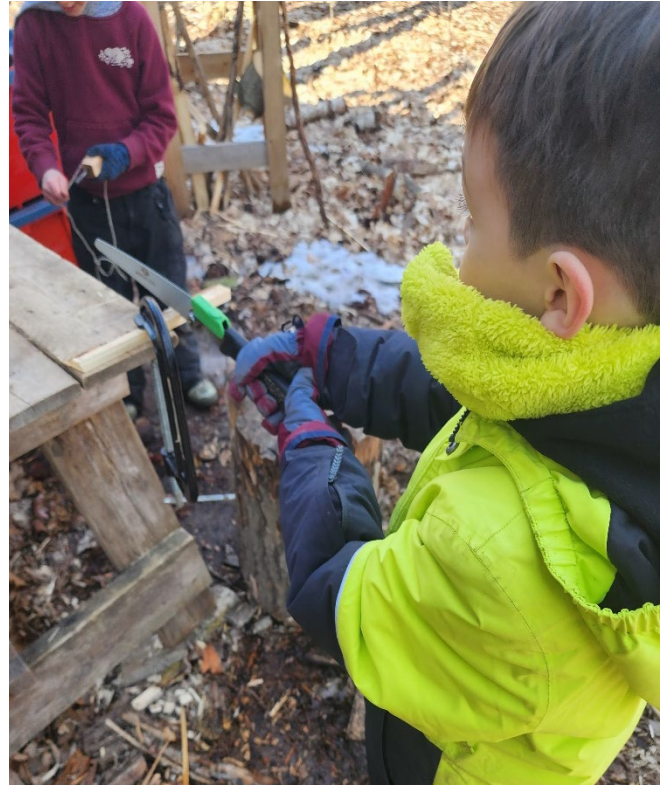
Saw skills at work! So much improvement in skills with increasingly more complex projects