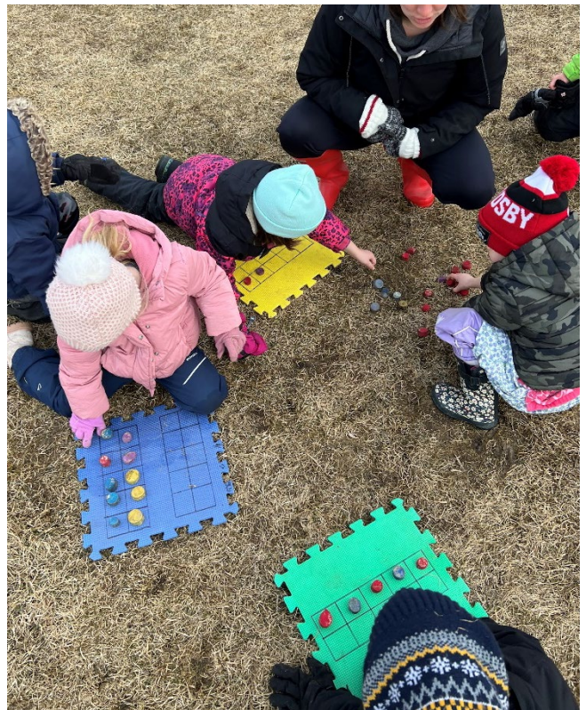
Students helping squirrel collect "food" and sort into 10-frame plates for his friends, some even making patterns