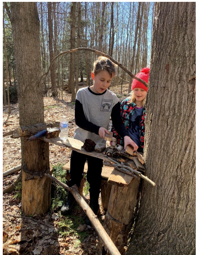
Creating more "storefronts" for trading of resources