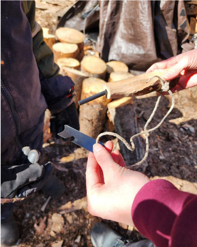
Flint and steel – not an easy feat to create fire from this method but with perserverance it can be done