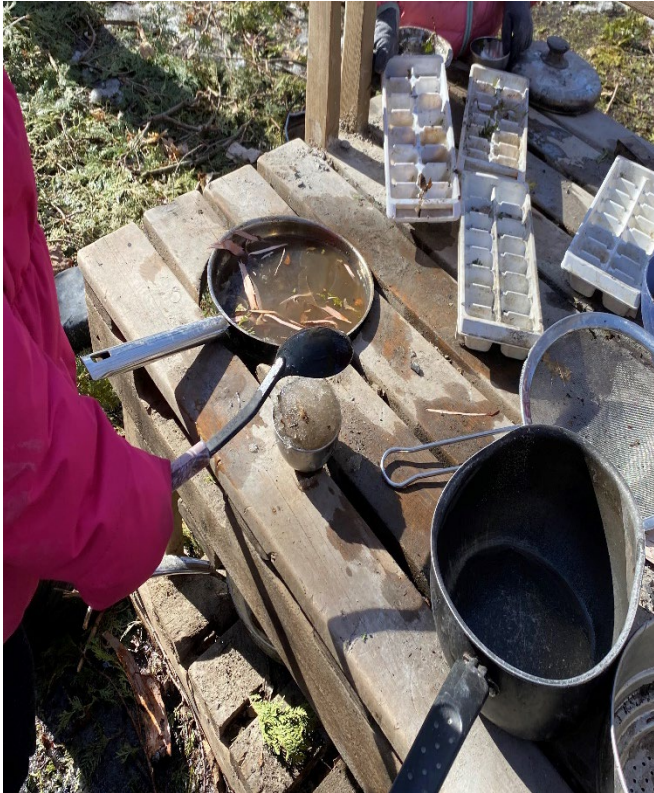
The kitchen is a place of creativity and imagination, with a dash of snow and a pinch of mud