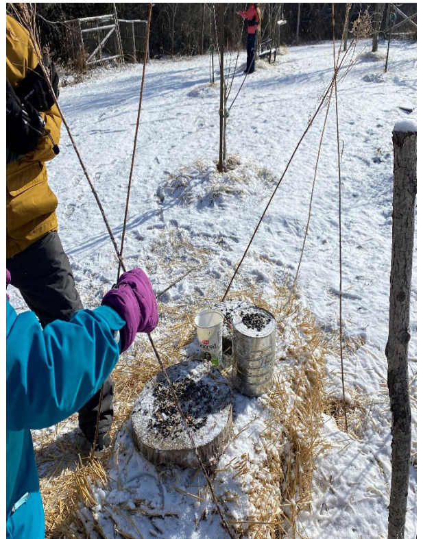
Setting out a feast for the birds