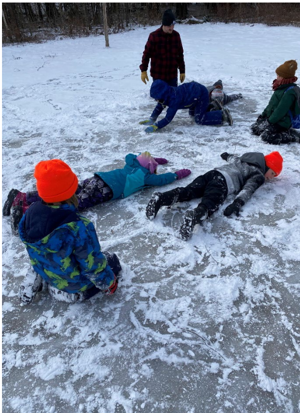
Ice is the perfect setting to learn about friction and other forces!