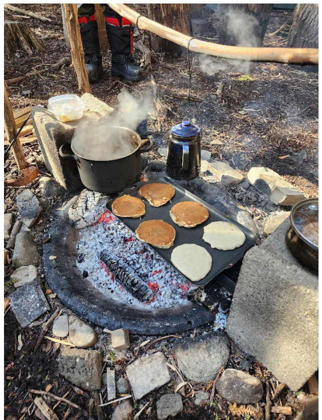
A feast fit for growing pre-teen/teen Rangers! Sourdough pancakes and fresh from the tree maple syrup