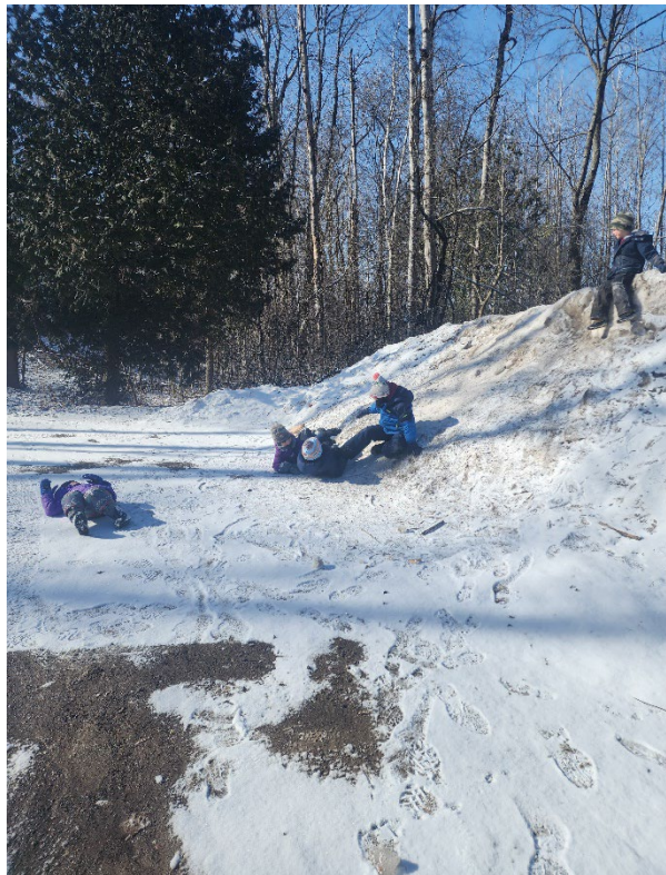
Rolling, tumbling, sitting, watching, sliding – so much to do on one snow hill!