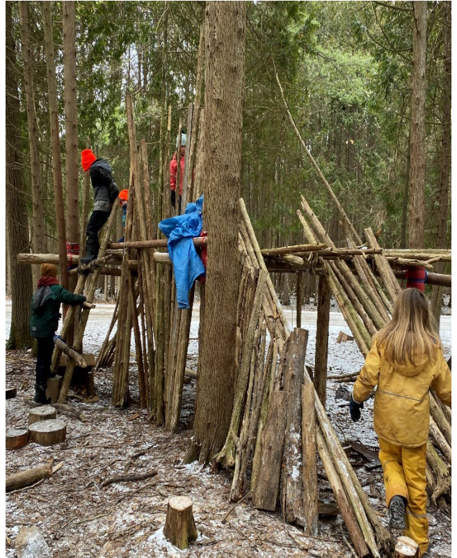
This fort has been an ongoing project for the entire school year – so much commitment!