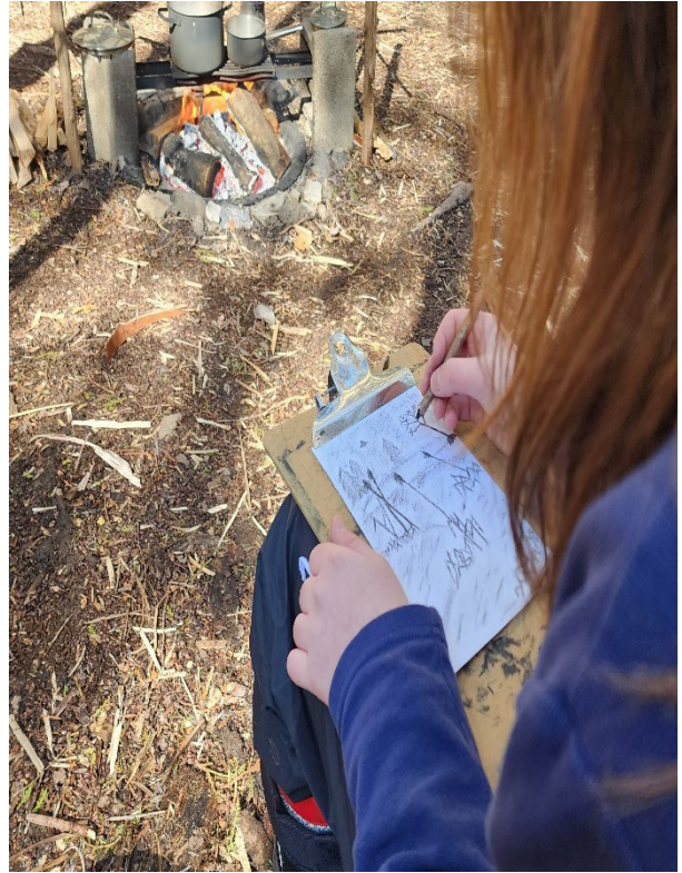
Using the charcoal pencils Rangers crafted to create art