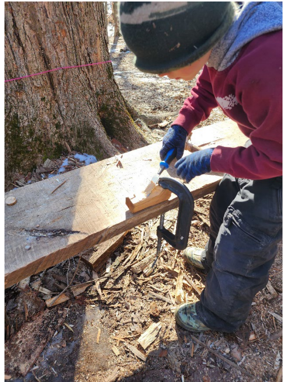
Chisel skills at work!