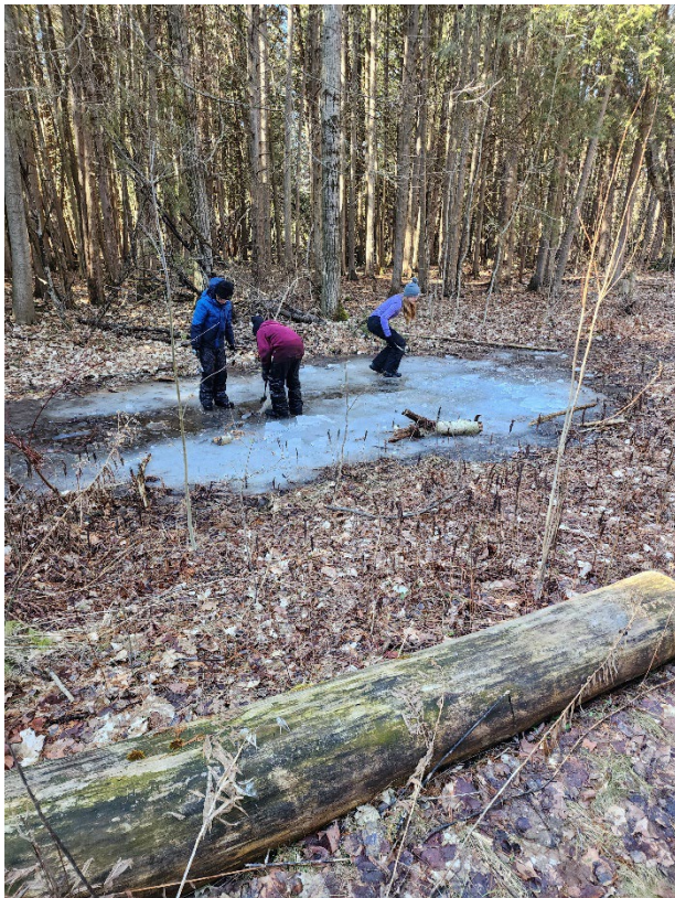
Ice exploration will never get boring