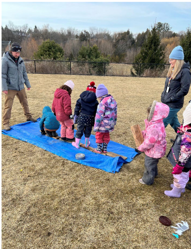
Kindergarten students working together to figure out how to cross the river to help coyote collect his clothes