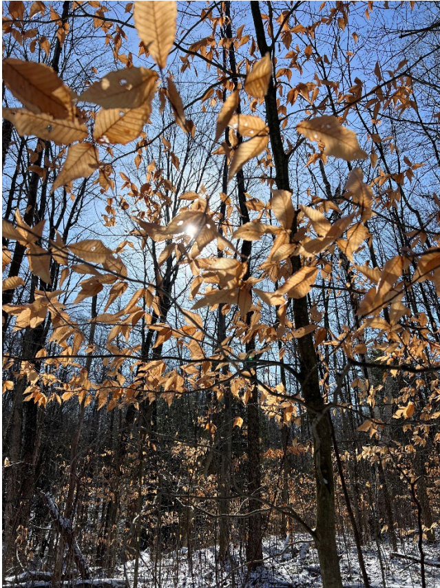
Golden beech leaves shining bright and rustling in the wind