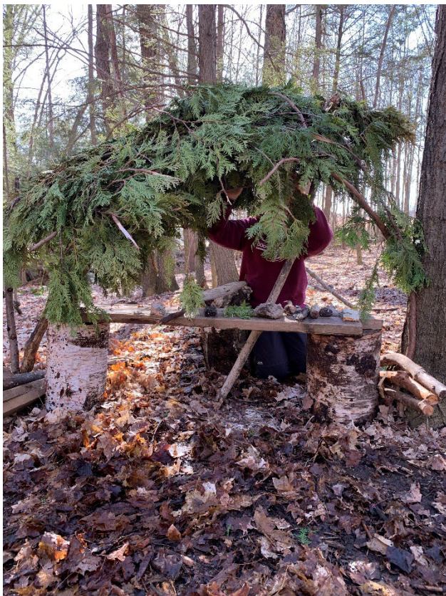
The Cedar Shop Trading Post was a busy spot this week