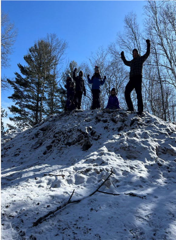
The mountain climbers made it to the top of Mount Dogwood!