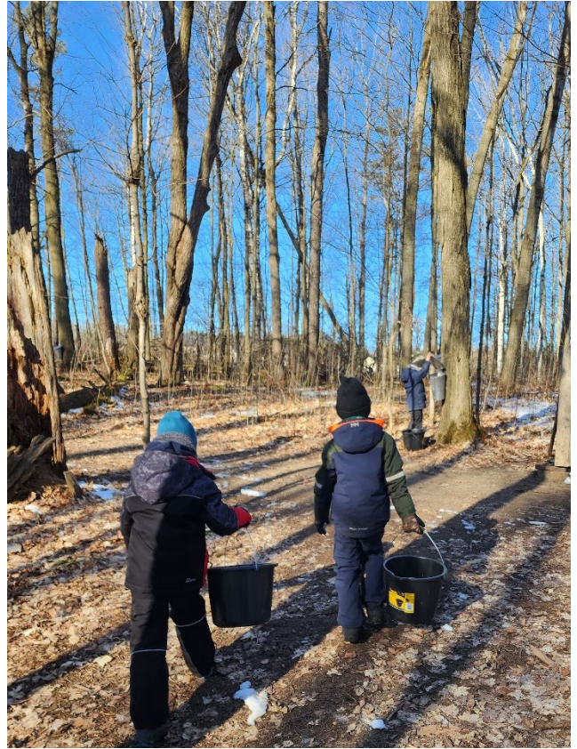
Collecting sap has been a daily job this time of year