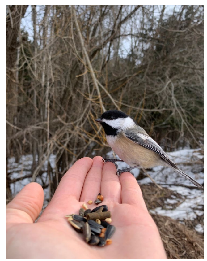
There is always time to feed the chickadees!