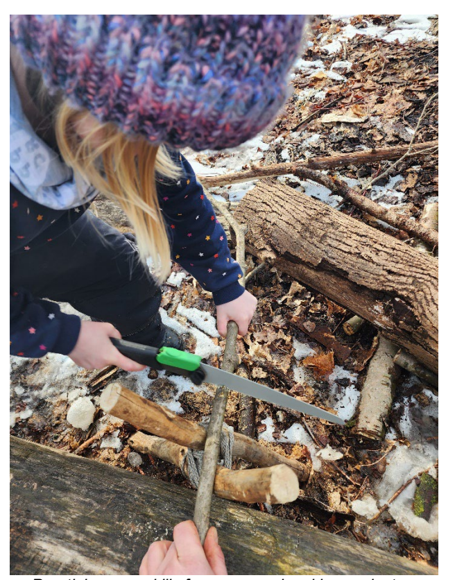
Practicing saw skills for new woodworking projects