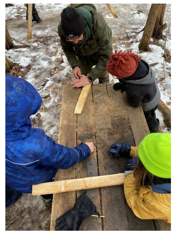
Pine demonstrating how to use a chisel