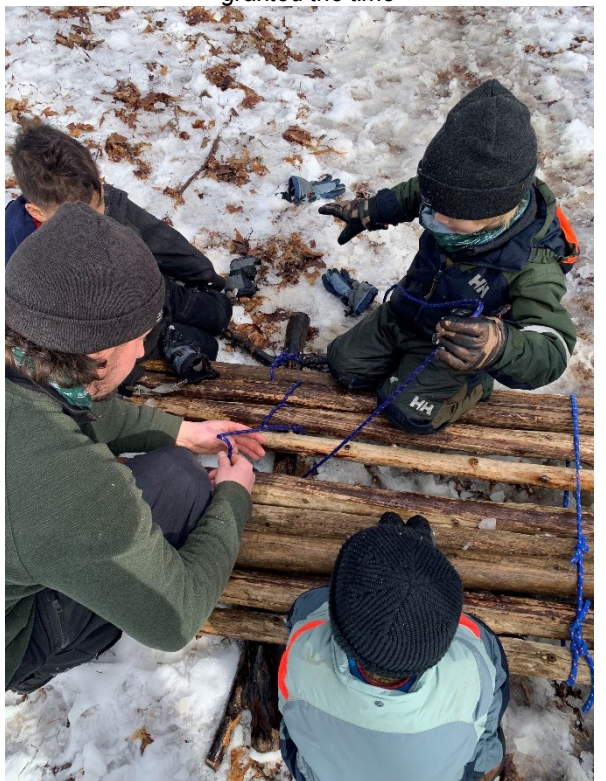
Practicing lashing and frapping with rope and cedar logs with Mosquito's support to be able to transport the logs