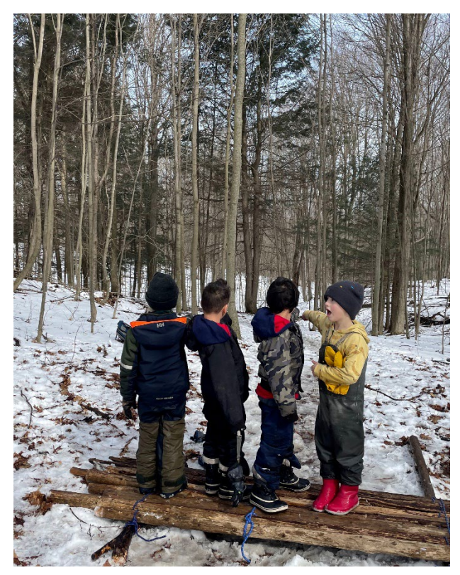
Testing out the bridge's stability