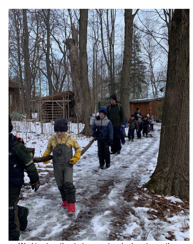
Working together to transport cedar logs to another area of the forest