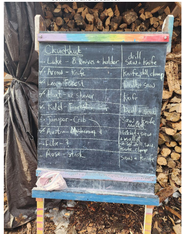
The only way to keep track of everyone's woodworking interests and the tools they need ( 905) 429 – 1498