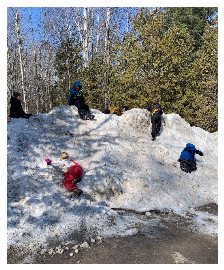
A snowy hill can provide so much joy and learning when granted the time