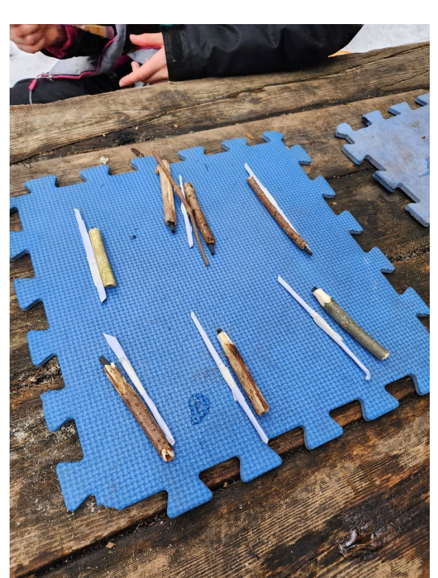
The charcoal tools – end result