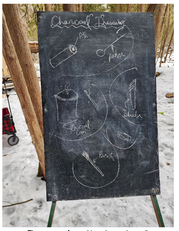
The process for making charcoal pencils