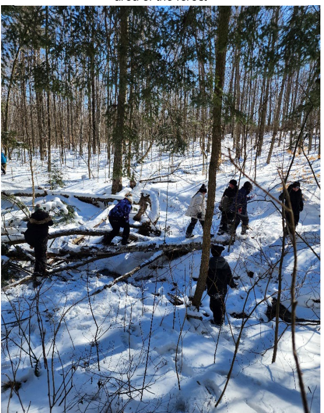
The homeschool group had a blast exploring the snowy and sunny forest!