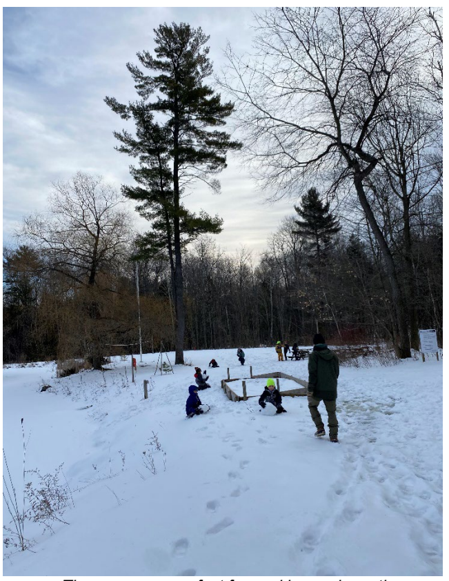
The snow was perfect for packing and creating