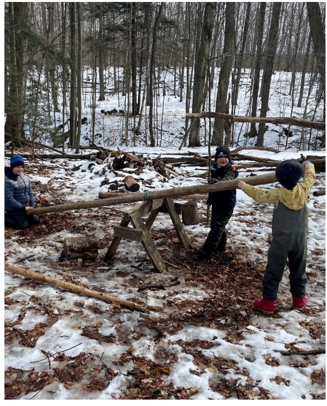
Friendship and science principles at work