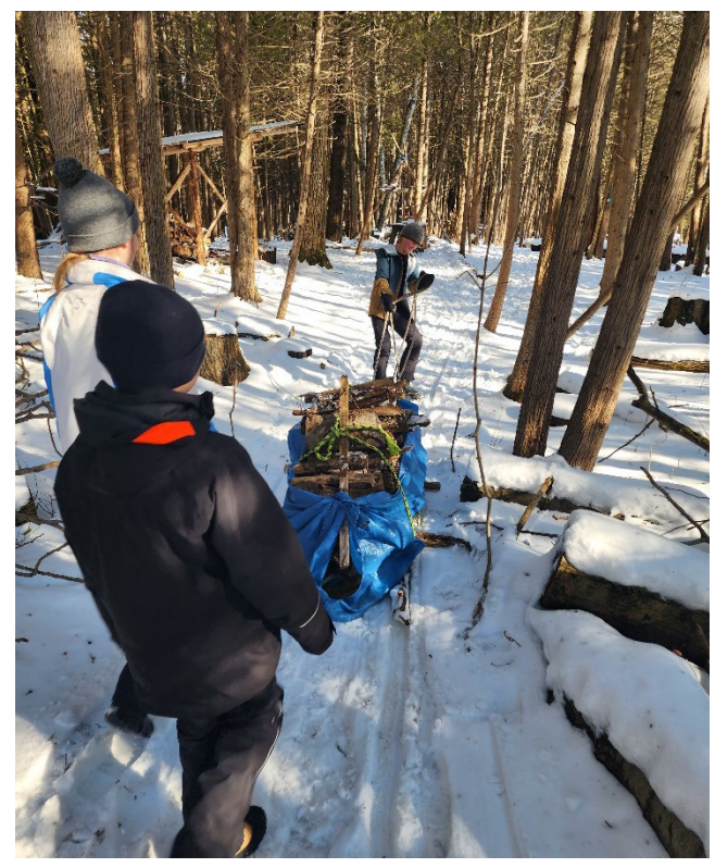
Working together to move a large pile of wood through the forest to the new shed