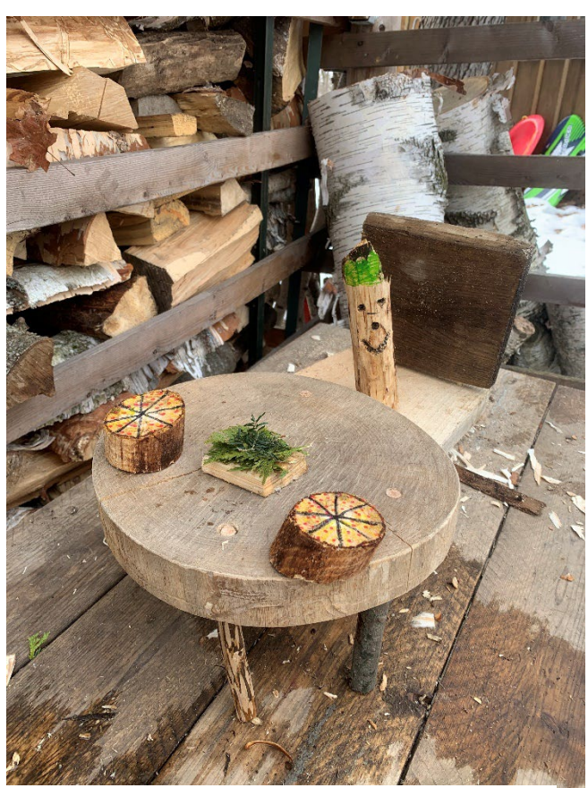
A feast fit for a Gnome King – the table and chair were hand-crafted by the Sprouts