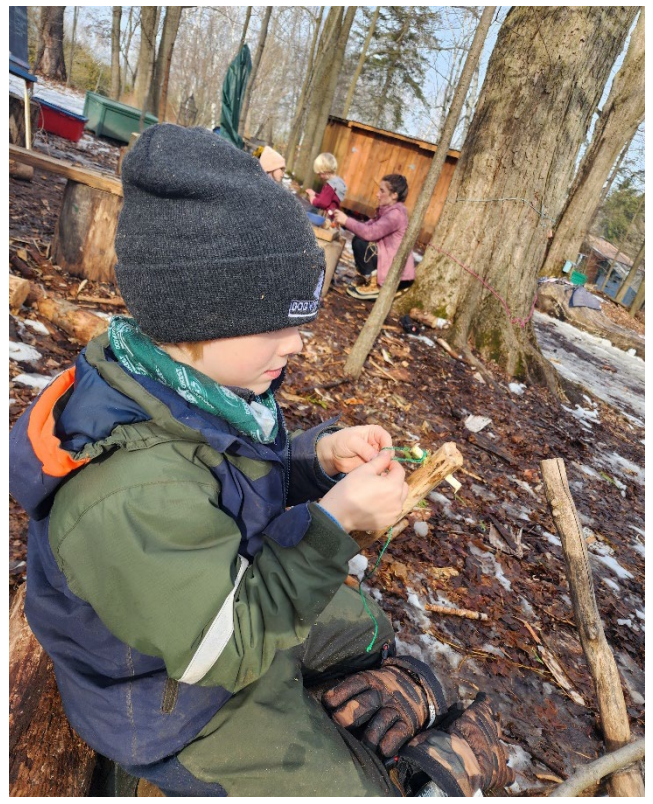
The wood projects are becoming increasingly complex and creative!