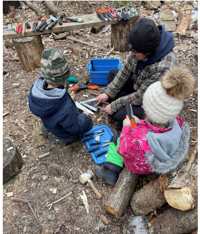
Working with Mosquito to clean the tools and keep them in safe and good working condition