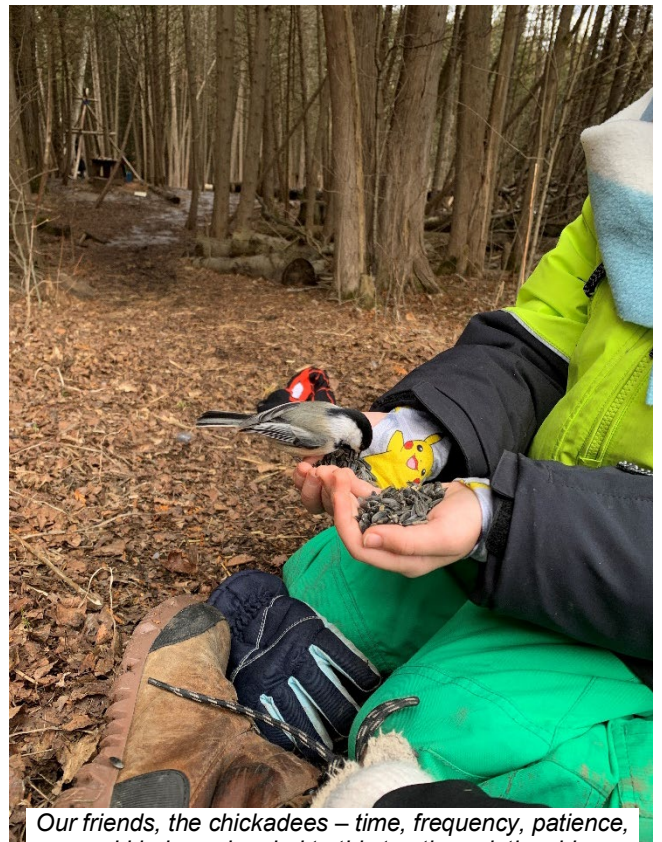
Our friends, the chickadees – time, frequency, patience, and kindness has led to this trusting relationship