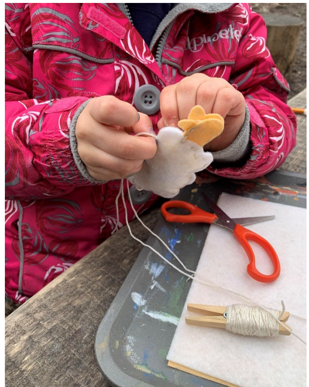
Creating felt sheep