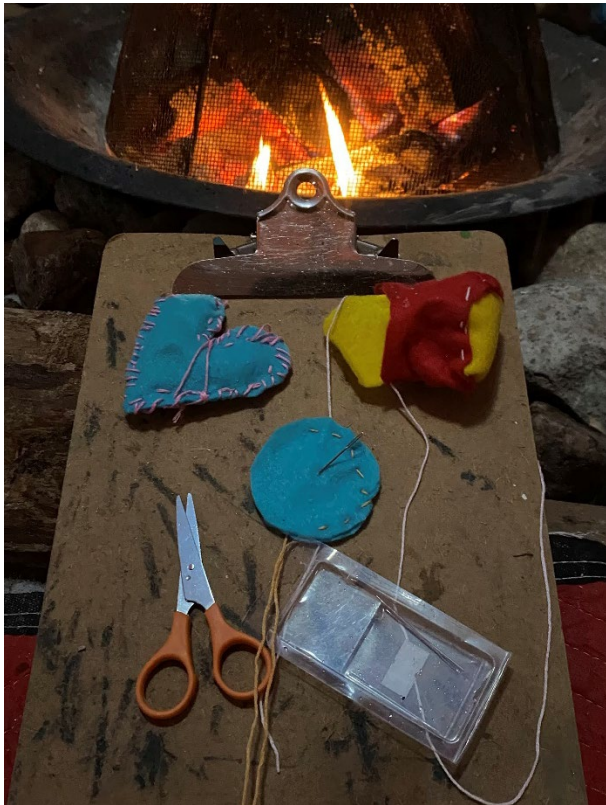
Continuing our sewing skills in the warmth of the tipi