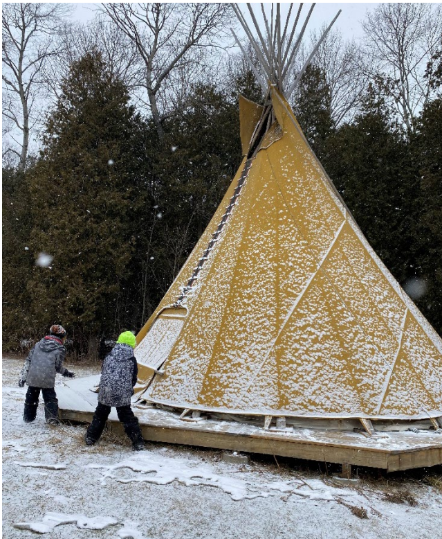
Helping to shovel the snow off the tipi deck to keep it working efficiently – thanks friends!