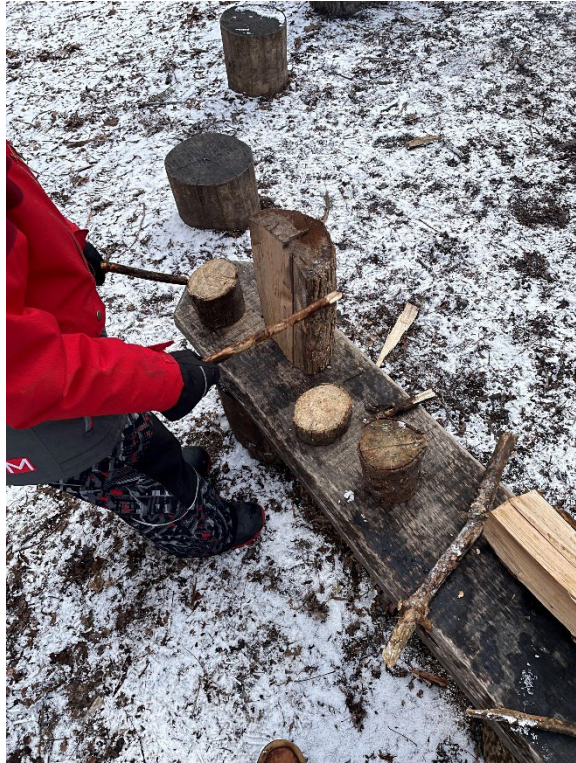
Music time! Listening to different sounds of wood