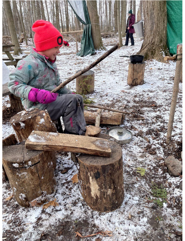
Made a drumkit with different wood, playing the drums!