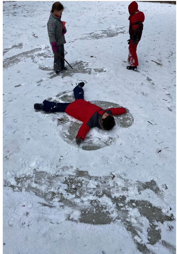
Exploring ice and making ice angels