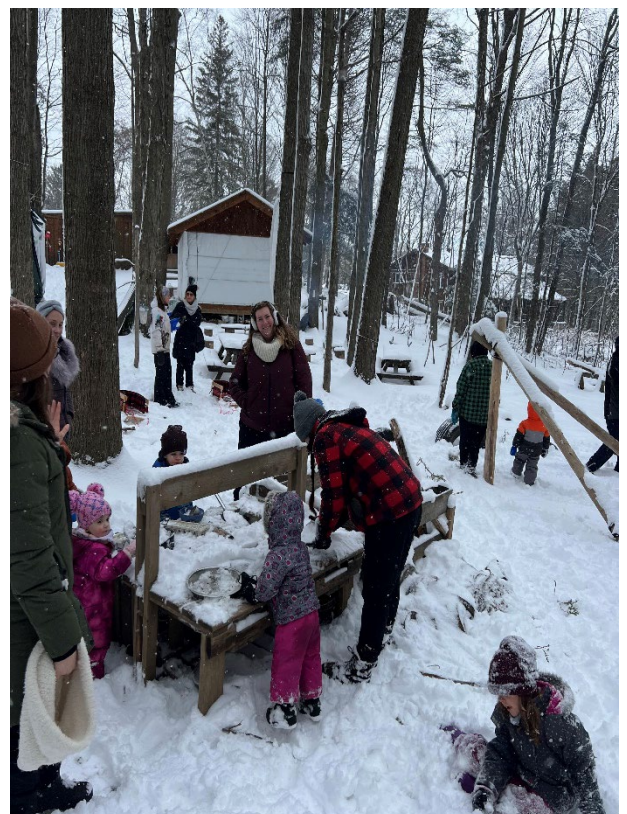
The tots loved playing in the snow kitchen, climbing over tires, and singing around the warm fire