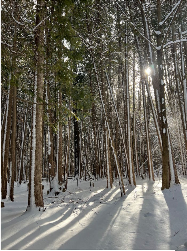
A sunny magical forest moment – slow down, breathe in the fresh air, be present