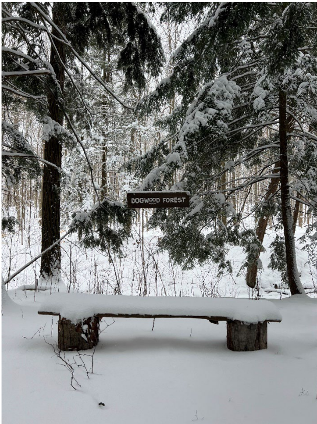
Freshly fallen snow at Dogwood Forest – snap a photo here and tag us next time you visit!

Another week of forest school has come and gone and we are nearing the end of the term - only 2 more weeks left. Although, we have had to put a pause on sap collection and maple syrup, we are grateful for the snow and all that it provides. We hope you can get outside this Family Day long weekend to enjoy it too!