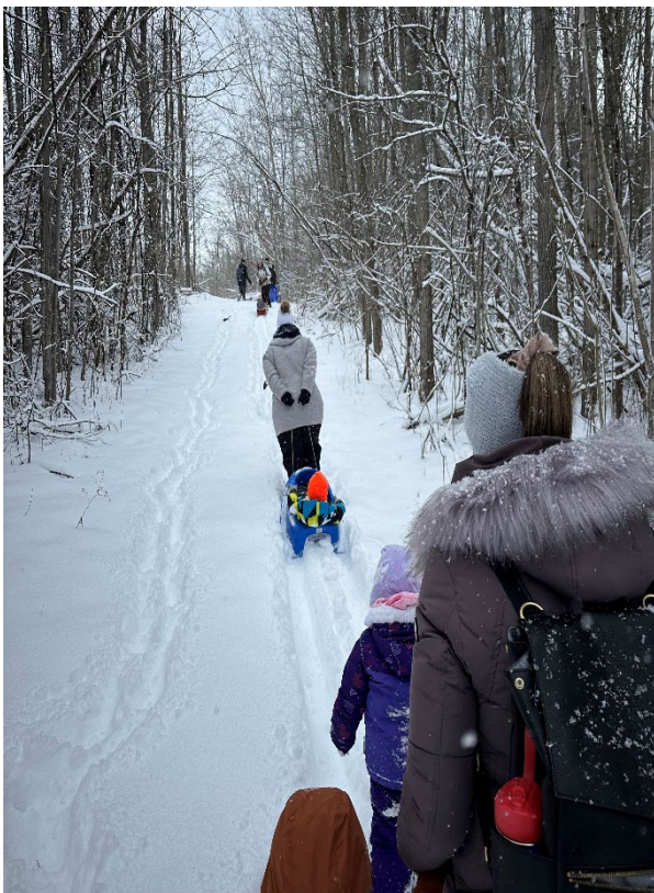
Exploring the snowy forest with the Travel Tots of Durham Mommy Connections