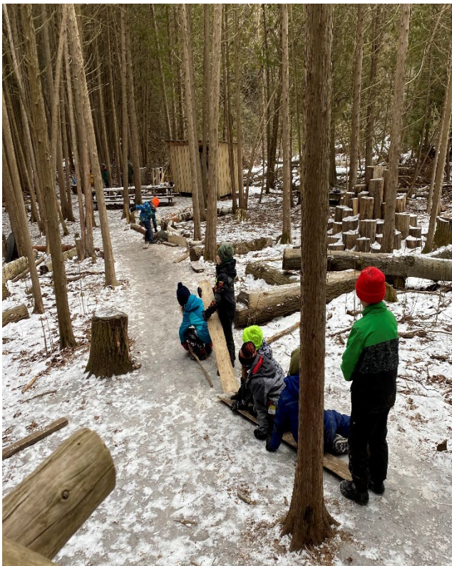
Working together to cross the icy trail