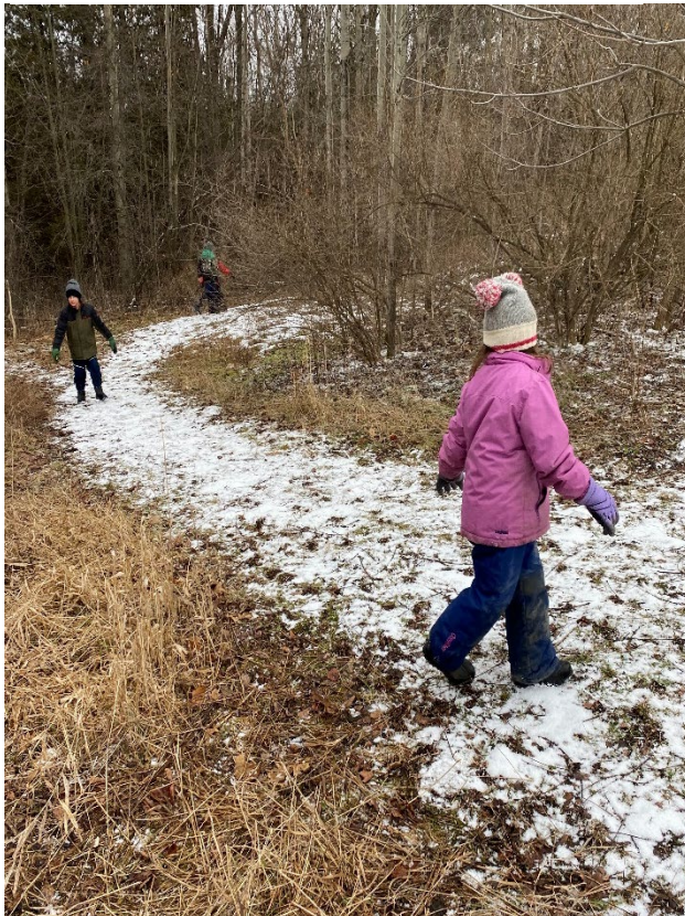
Exploring the trails at Berry Patch