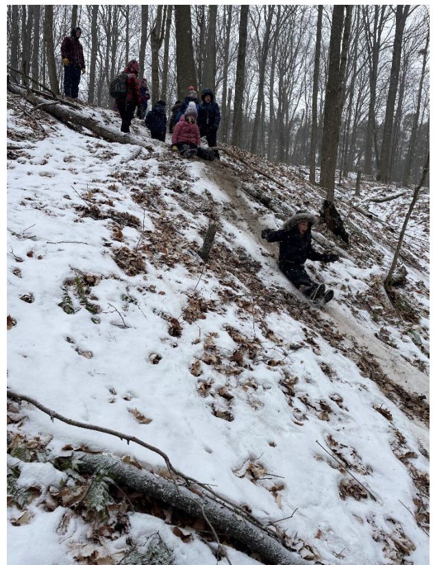
Visible: child sliding down a hill “playing” Invisible: patience, sharing, risk assessment, balance/core strength, critical thinking