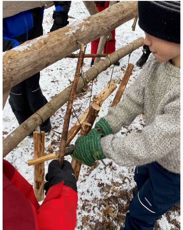
Playing music on the new wood chime Mosquito created at the Den site