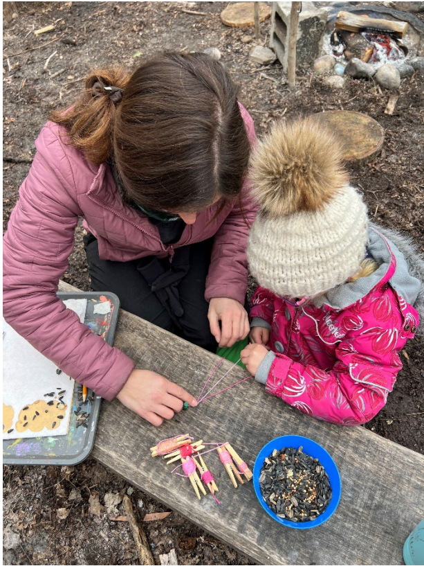
"Working together to learn how to braid"