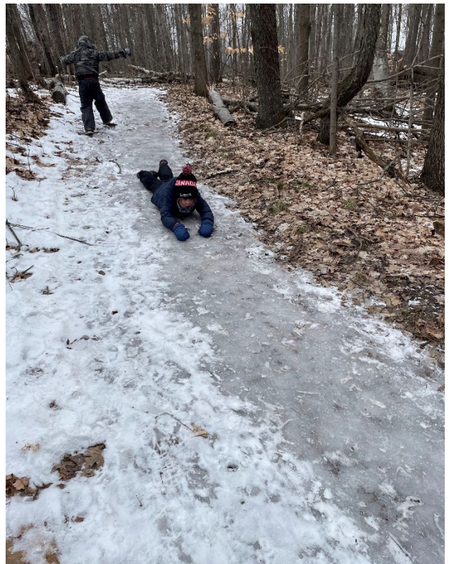
Learning about friction first-hand – ice slides!