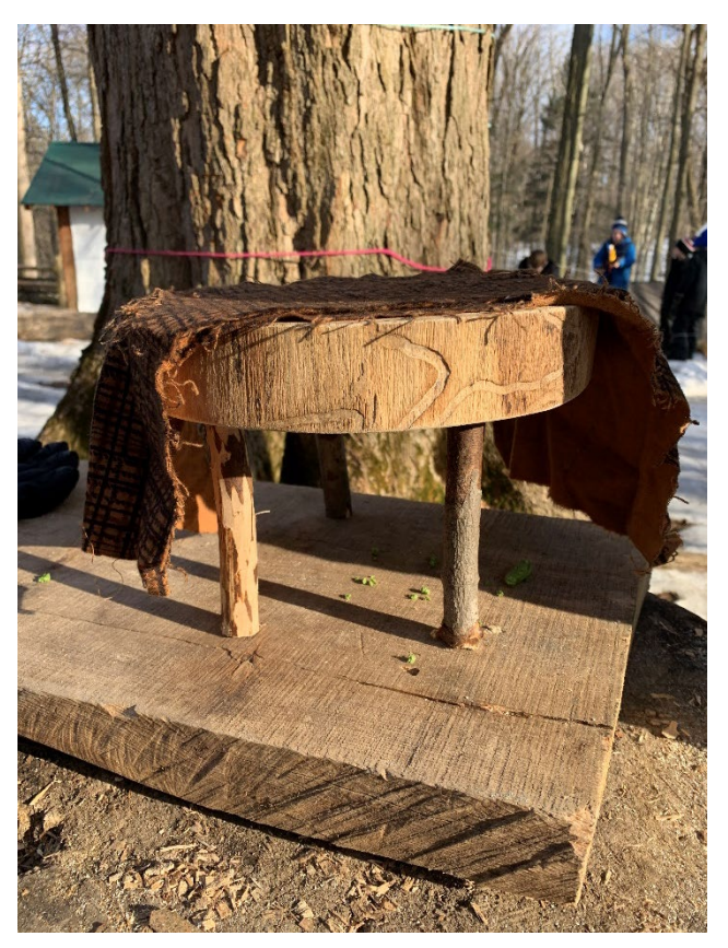
The Sprouts made a mini table