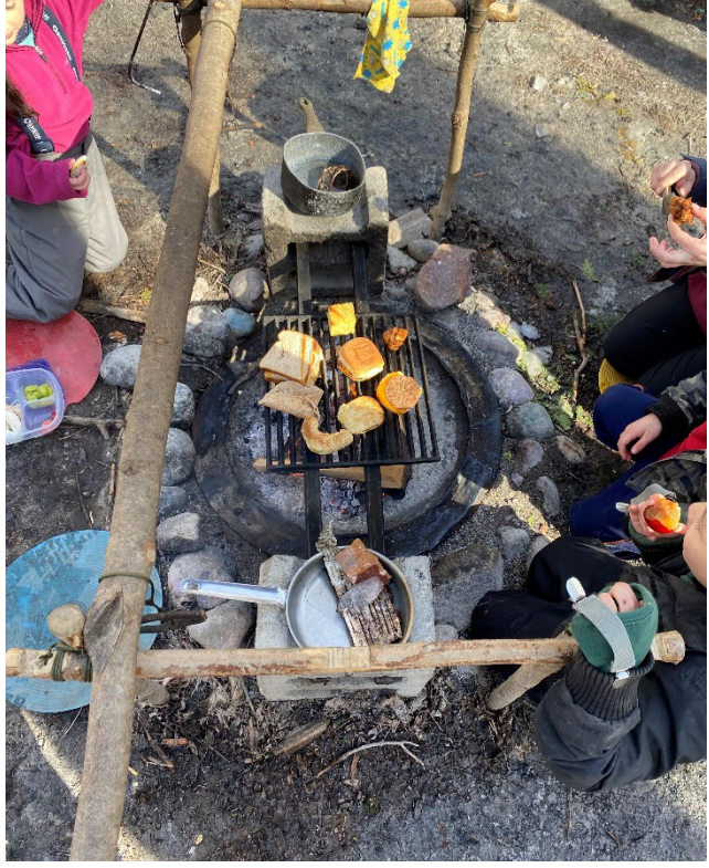
Most of our forest schoolers love cooking over the fire – plus it supports skill building and a joy for cooking/food