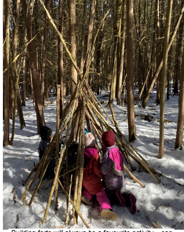
Building forts will always be a favourite activity – can you remember the last time you built a fort?