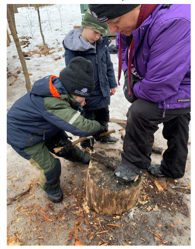
Teamwork makes the dreamwork!