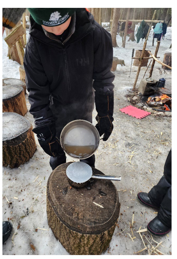
We boiled a small amount of sap down to create an even smaller amount of syrup; the ratio is 40:1