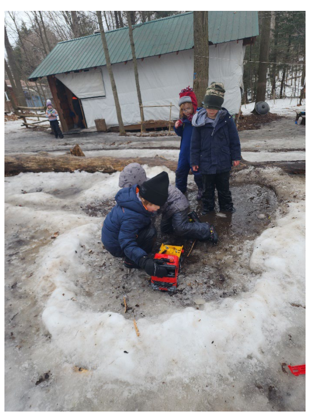
"Maple Sap Pond" – provides space for many inquiries and lots of play!