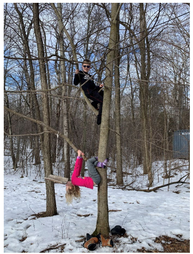
Climbing - one aspect of "risky play"