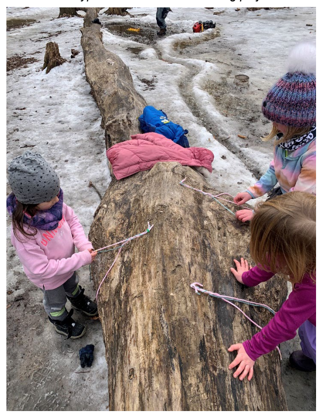
Learning and practicing the skill of braiding