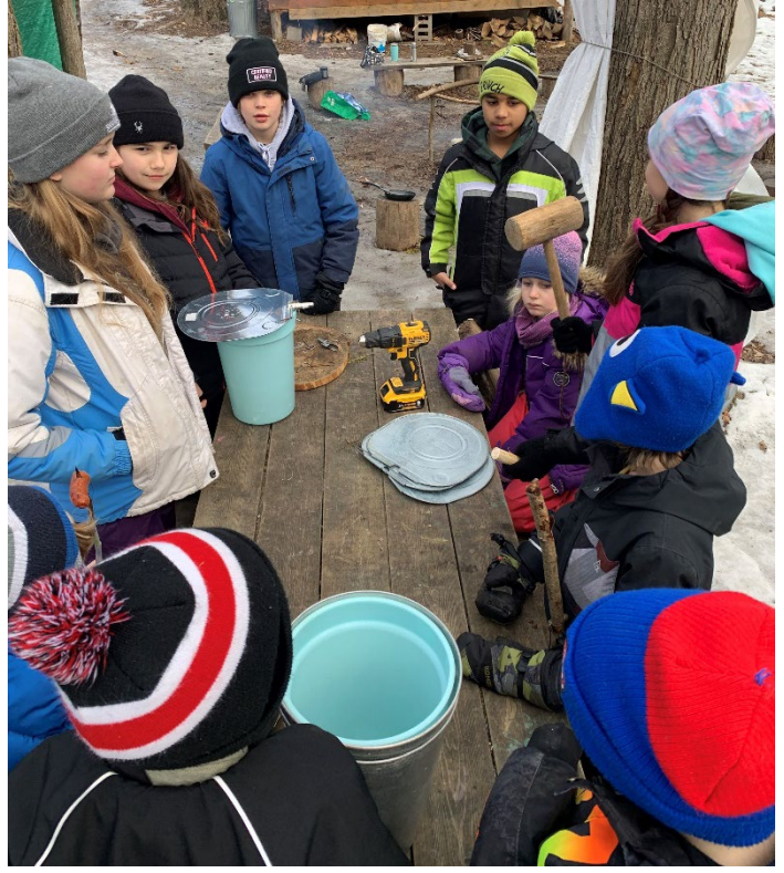
The Rangers worked with the Sprouts teaching them about maple syrup and tapping maple trees