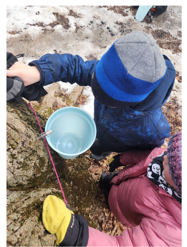
The buckets hang on a hook under the tap and a lid covers the bucket – we check the buckets every day!