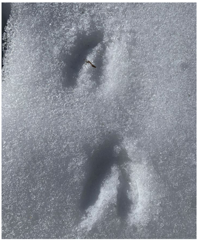
Can you guess who made these tracks? Ask your forest schooler!