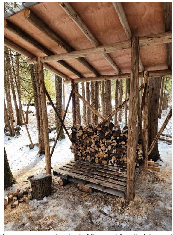
Of course we need a shed of firewood for all of the cooking of lunches and now maple sap we have – great start Rangers!