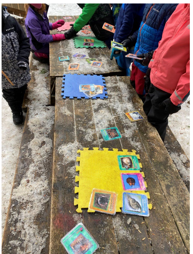
Exploring animal diets and teaching each other about the animal card we had