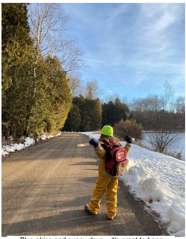
Blue skies and sunny days – it's great to hang outside all day!