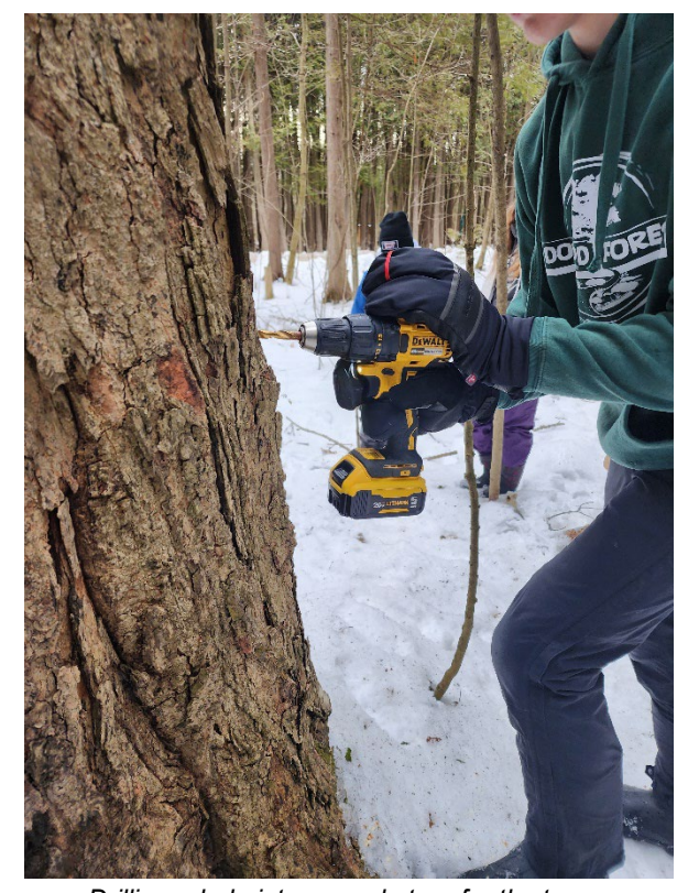
Drilling a hole into a maple tree for the tap