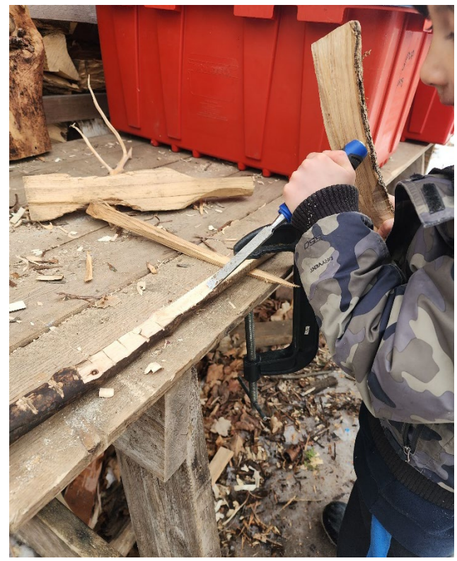
Becoming more and more comfortable using different types of tools for woodworking projects