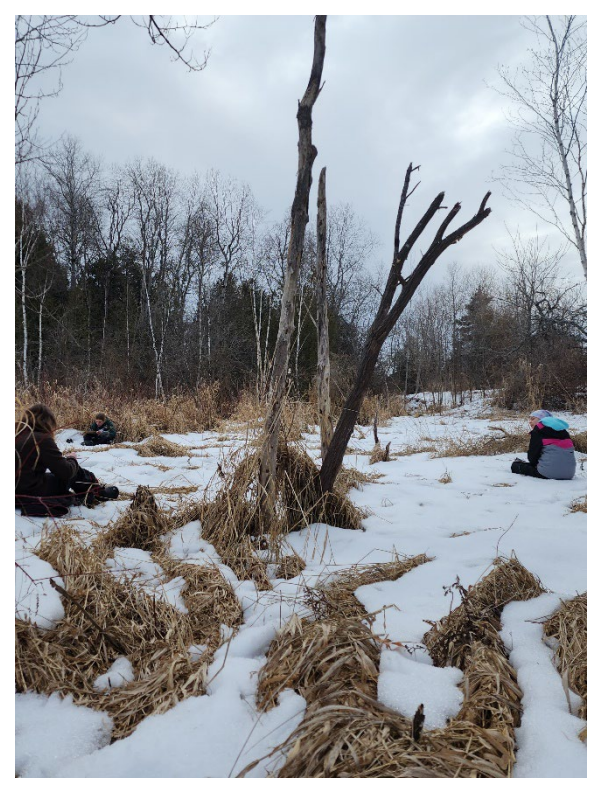
The Rangers enjoying a "sit spot" in the Marsh