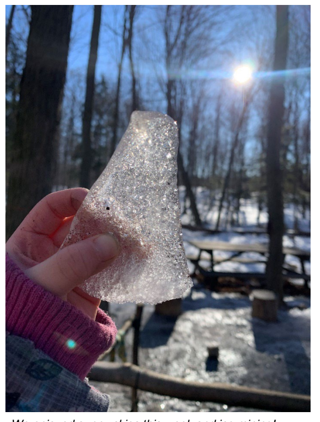
We enjoyed sunny skies this week and ice mining!