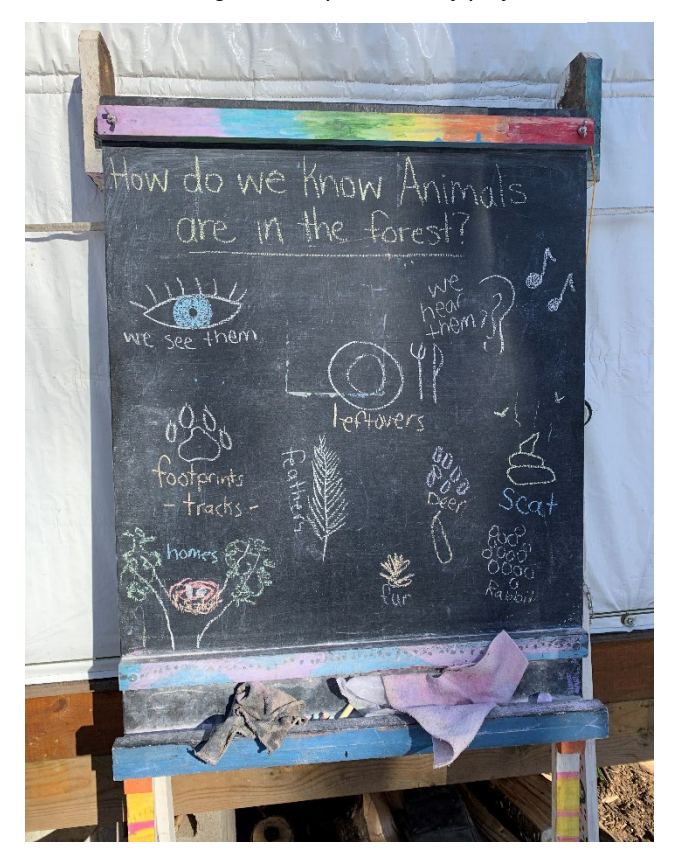
Forest schooler observations