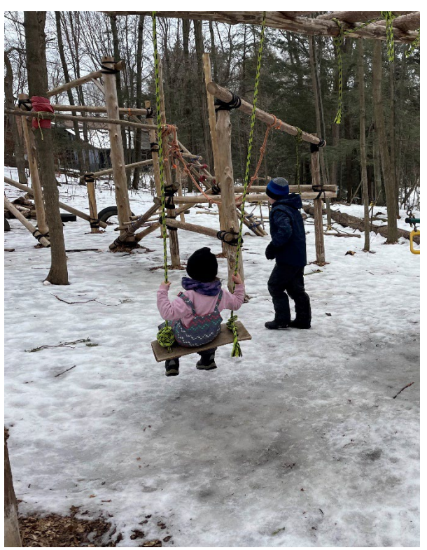
Swinging is a favourite thing of many