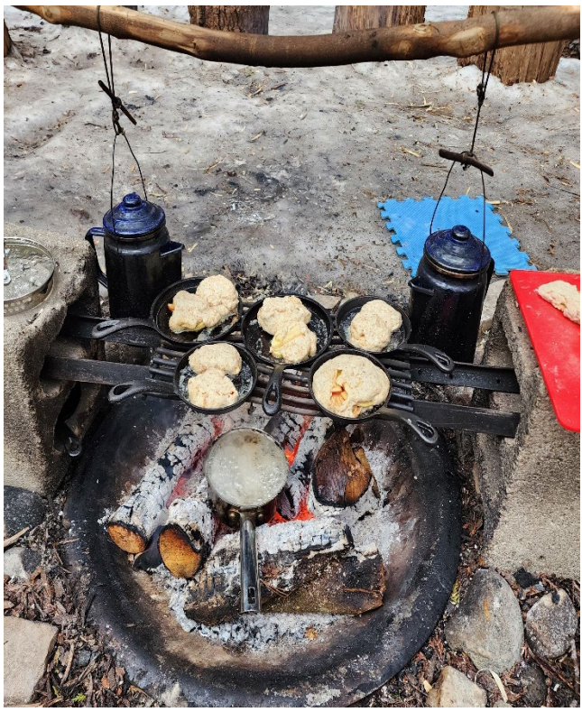
Apple cinnamon sourdough bannock with maple glaze – the Rangers called this the best thing they have cooked to date (droooool emoji)