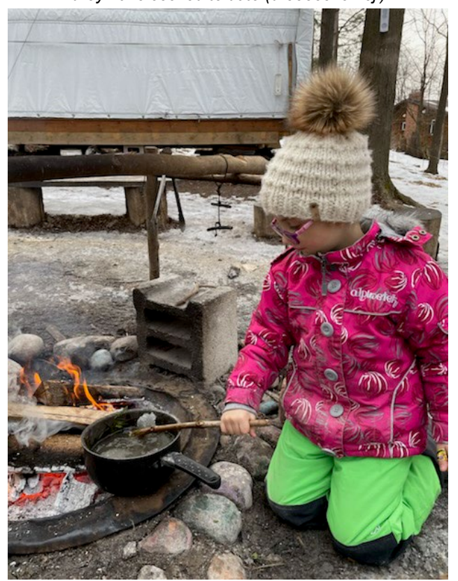
Melting more snow for kitchen play