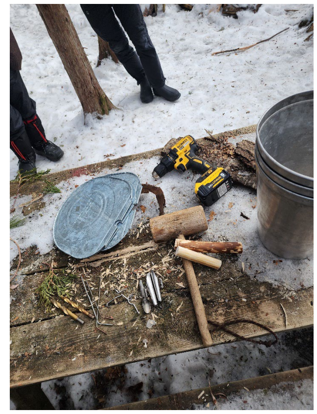
Spring weather has arrived early aka maple syrup season is here!