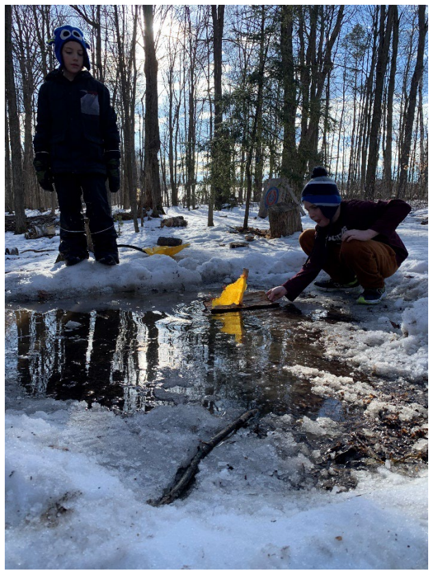
Another view of "Maple Sap Pond" – the sailboat works!