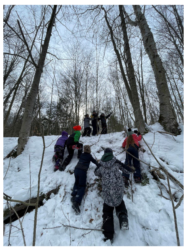
Climbing to great heights for a full view of the forest