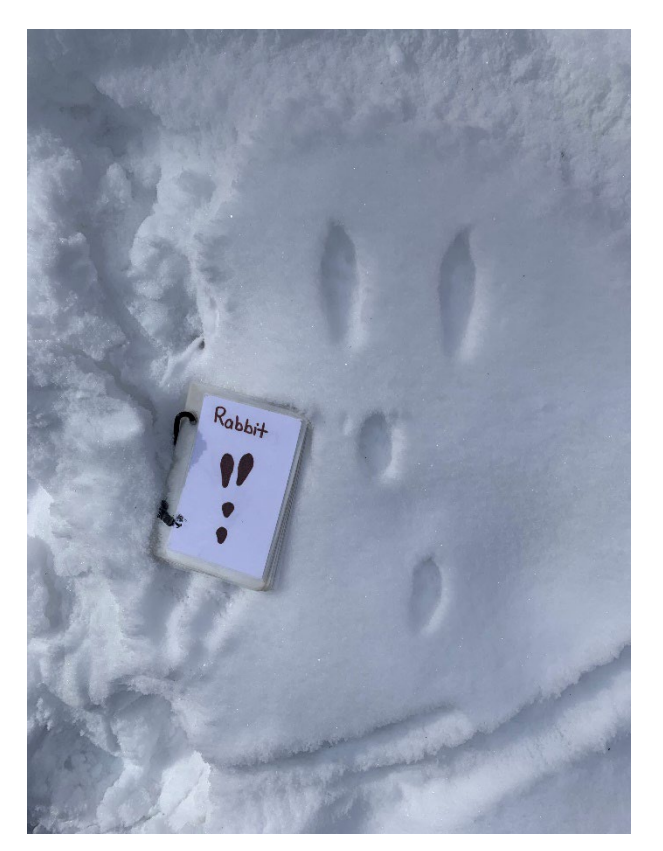
More rabbit tracks – what a perfect example