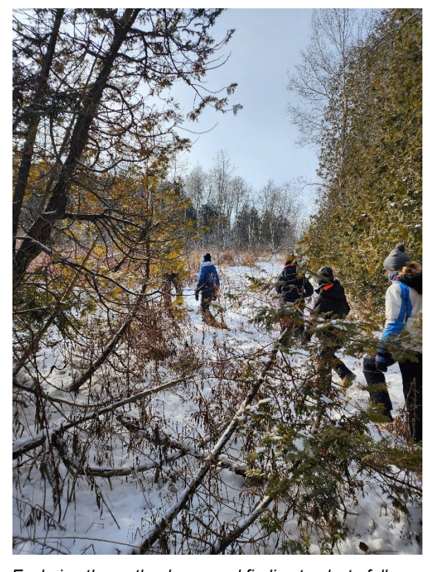
Exploring the wetland area and finding tracks to follow