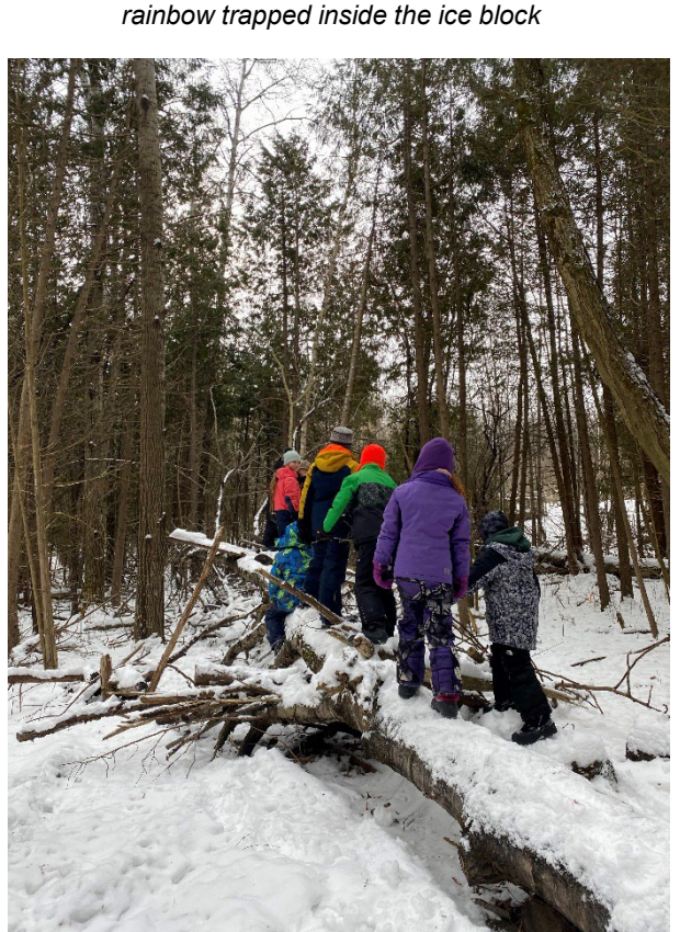
Balancing on a log (building core strength, practicing patience and focus, developing communication)