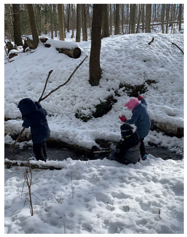
More ice assessment at the creek