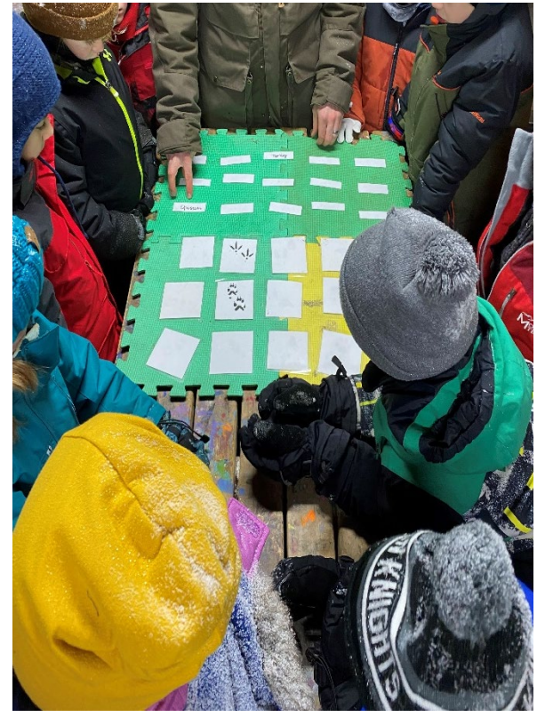
Matching images of tracks to animal names to test our knowledge