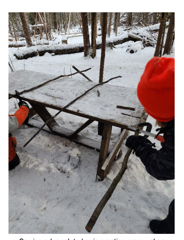
Sawing a branch to begin creating a snowshoe