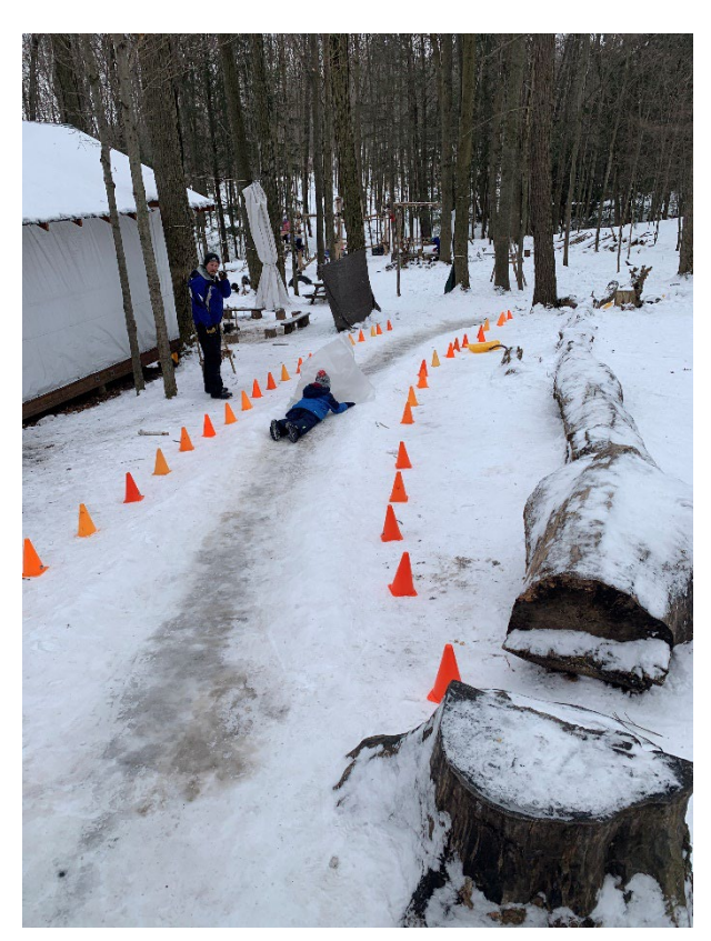
The famous snowslide that was a hit for any group at the Den this week!