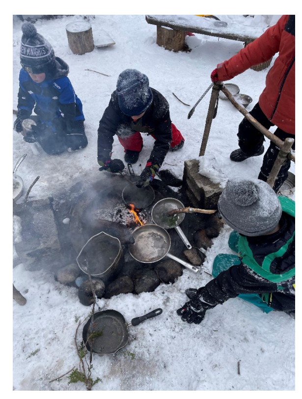
Melting snow over the fire to create water to ice the snow slide