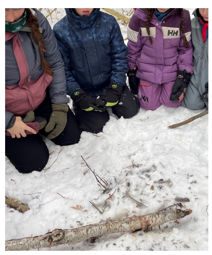
An interesting scene we stumbled upon with feathers and disturbed ground – we had to be detectives to figure out what might have happened