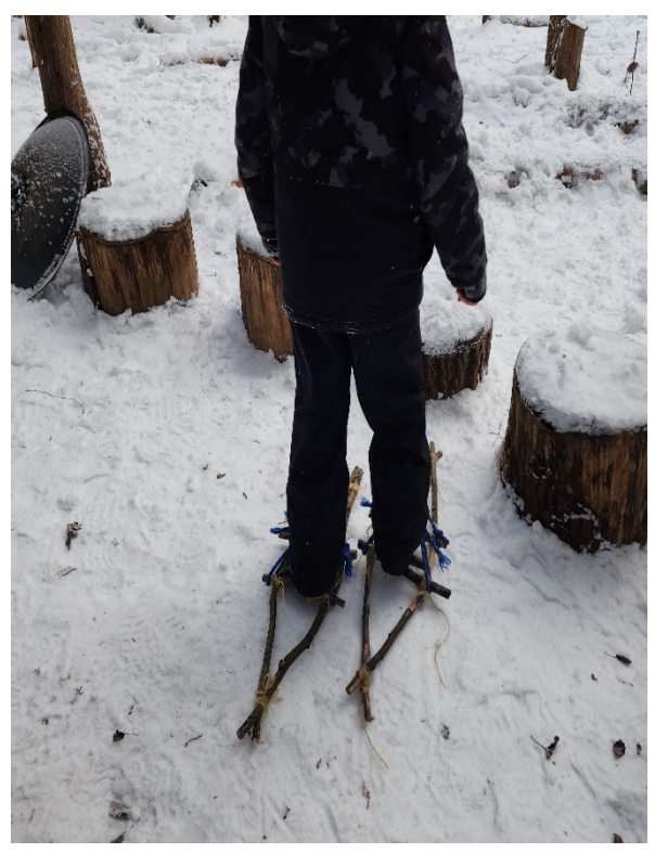
The final product – snowshoes complete!