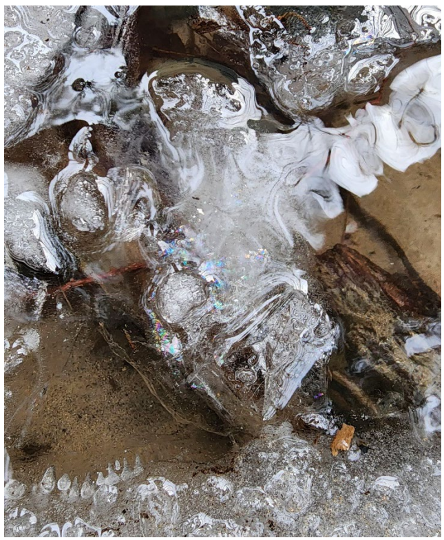
If you look close enough, you may find a rainbow trapped inside the ice block