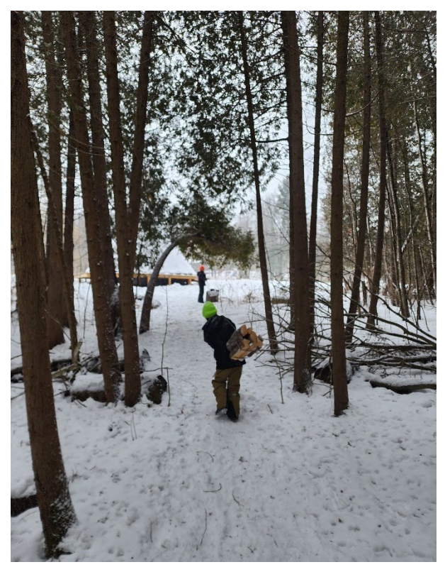
Carrying logs to the tipi to build a fire and create a warm space – community efforts that benefit all!