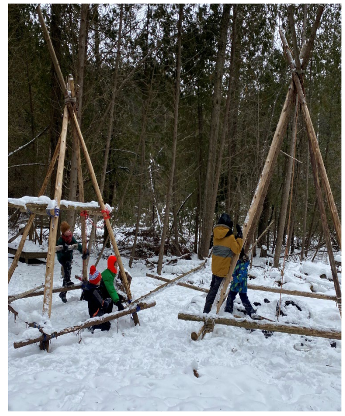
Community chats on the play pyramids