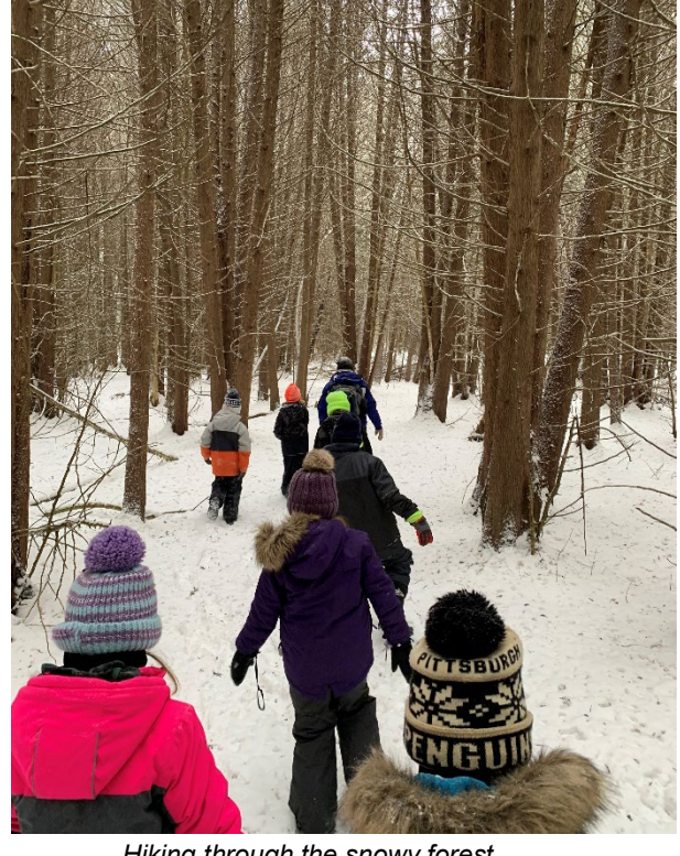
Hiking through the snowy forest