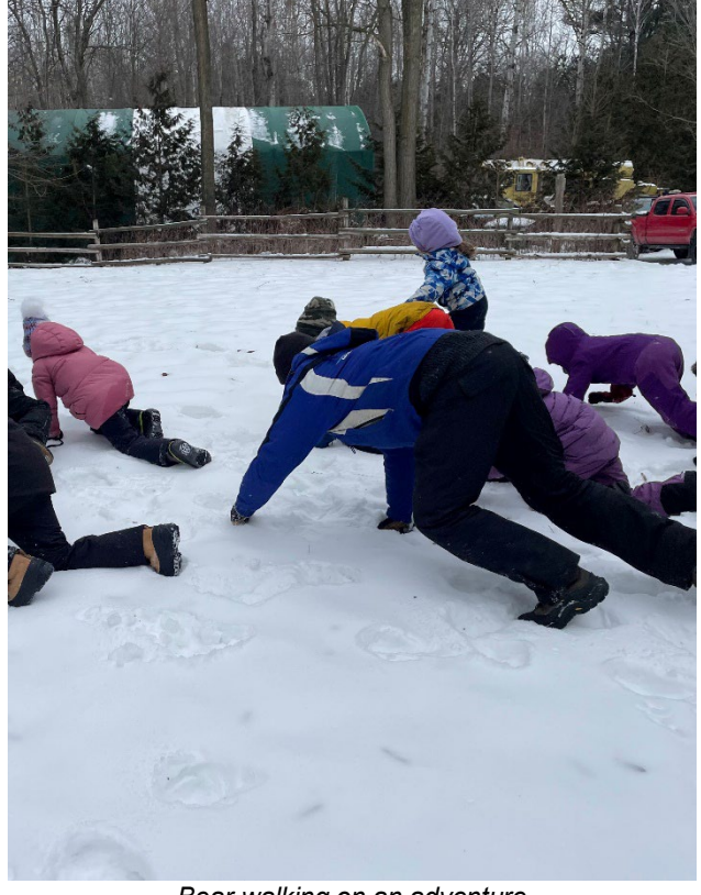
Bear walking on an adventure