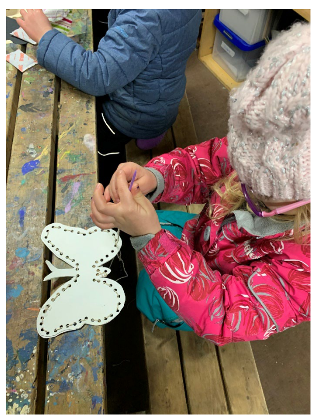
Continuing to practice our sewing skills, this time with a plastic needle