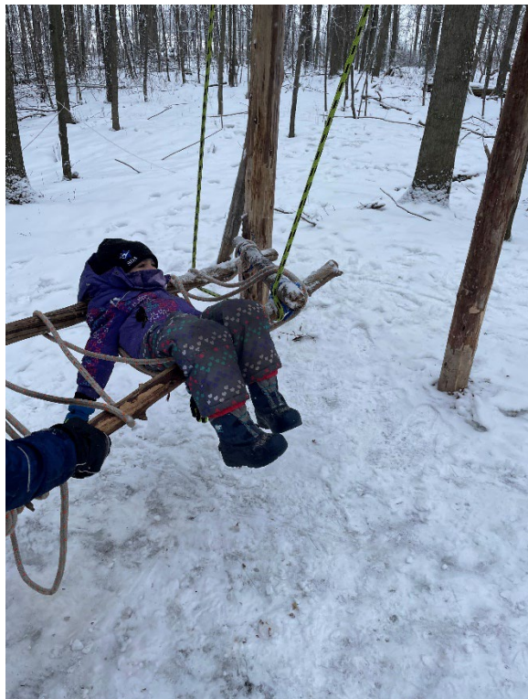
Lounging in the hammock we built