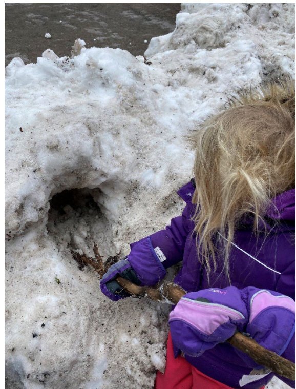
Digging a tunnel in the snow mountain