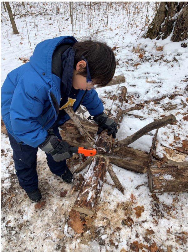
Practicing saw skills