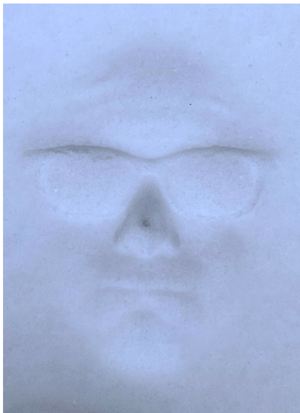
Snow face prints - give it a try!