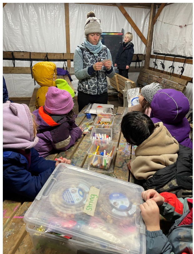
Learning basic sewing skills from Scooter