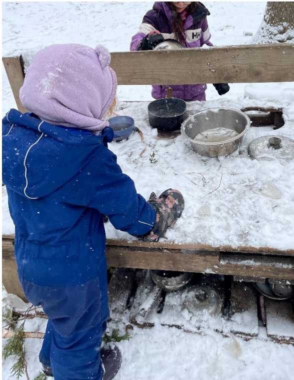
Creating at the mud (snow) kitchen