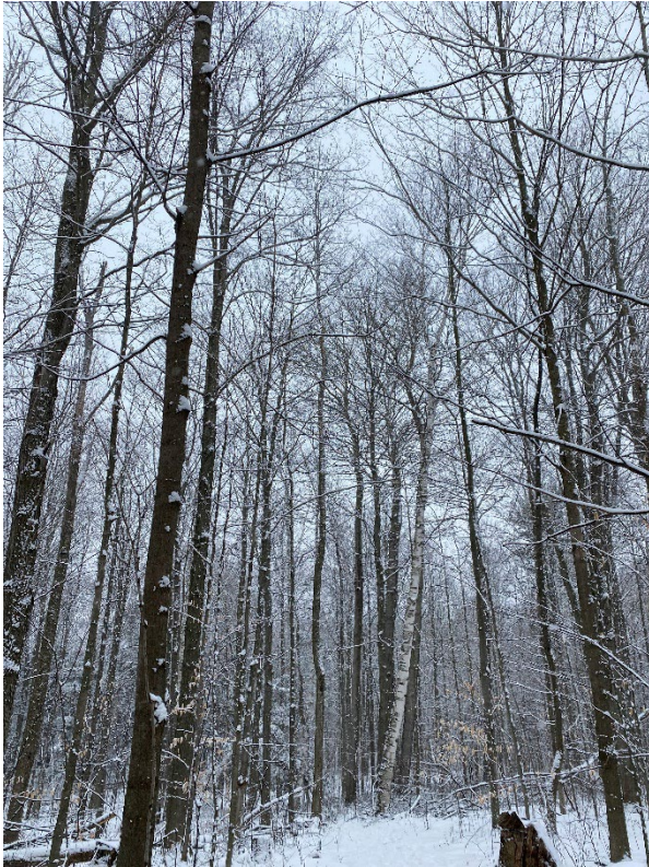
Welcome back to the wintery forest!