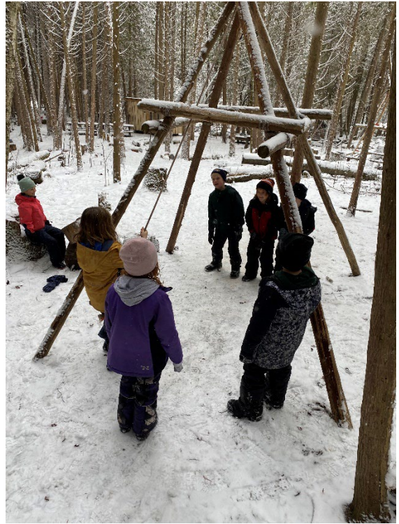
Taking turns on the swing + a bowling game that taught safe falls and assessing risk