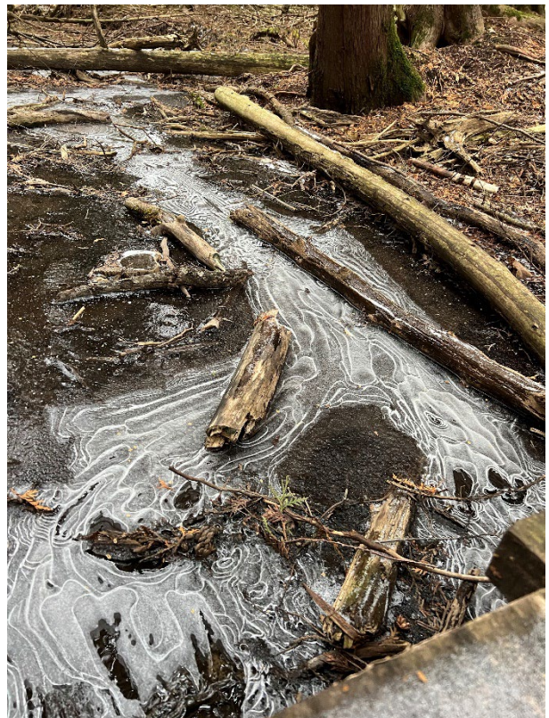
The beauty of nature when you slow down to see (water frozen in the creek)