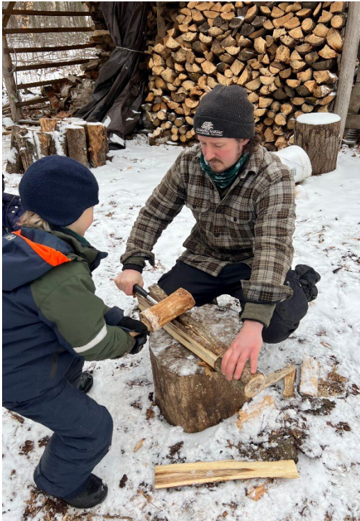
Building a wooden tool using a mallet and hatchet with the help of Mosquito