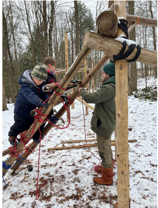
Practicing lashing and frapping to build a wooden ladder with the guidance of Pine