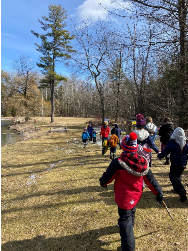
Loving the hikes on these sunny days!