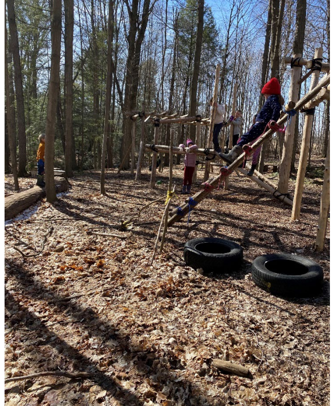
Open-ended exploring, climbing, playing, balancing, creating and more on the play structure