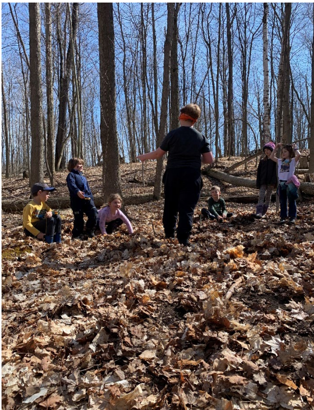
Playing Fire Keeper in the forest – a game requiring patience, quietness and strategy