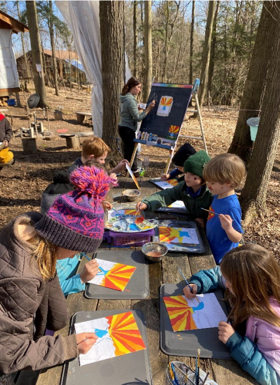
“Guided Painting” workshop with Otter, learning about colours, lines, and definition