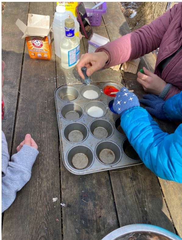
Creating water colour paint with every-day household items