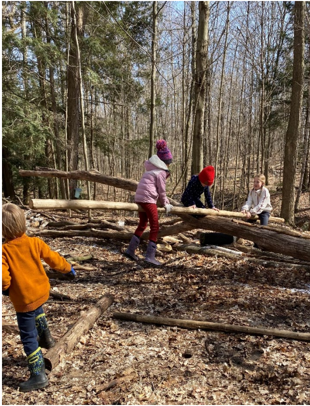
Playing on the child-created log seesaw