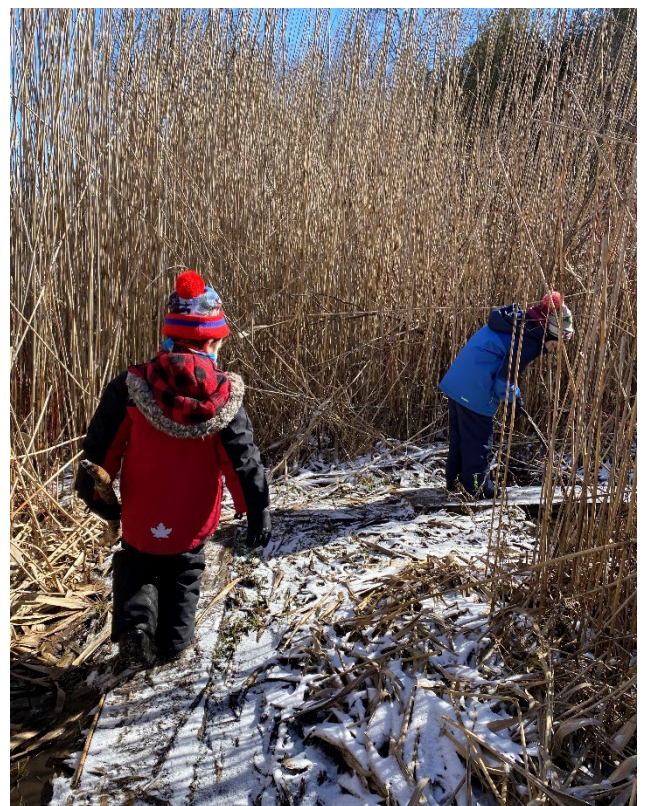
Exploring the boardwalk trail through the marsh