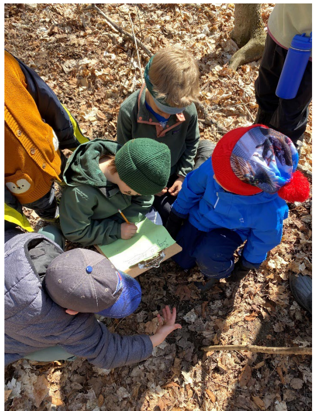
Practicing teamwork and collaboration through various challenges