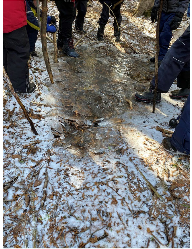
Exploring ice thickness in frozen puddles