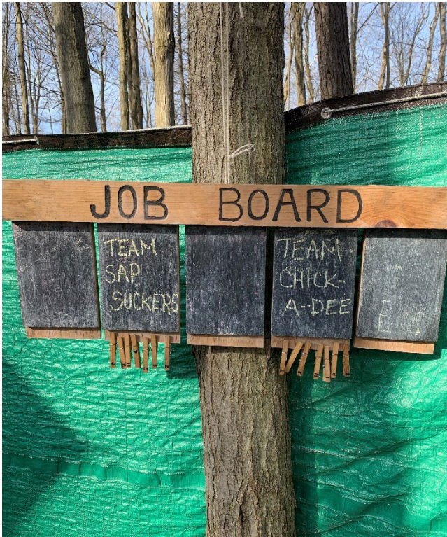
Jobs – things we do to show kindness and help our space and our community; this week campers picked between collecting sap and feeding the birds