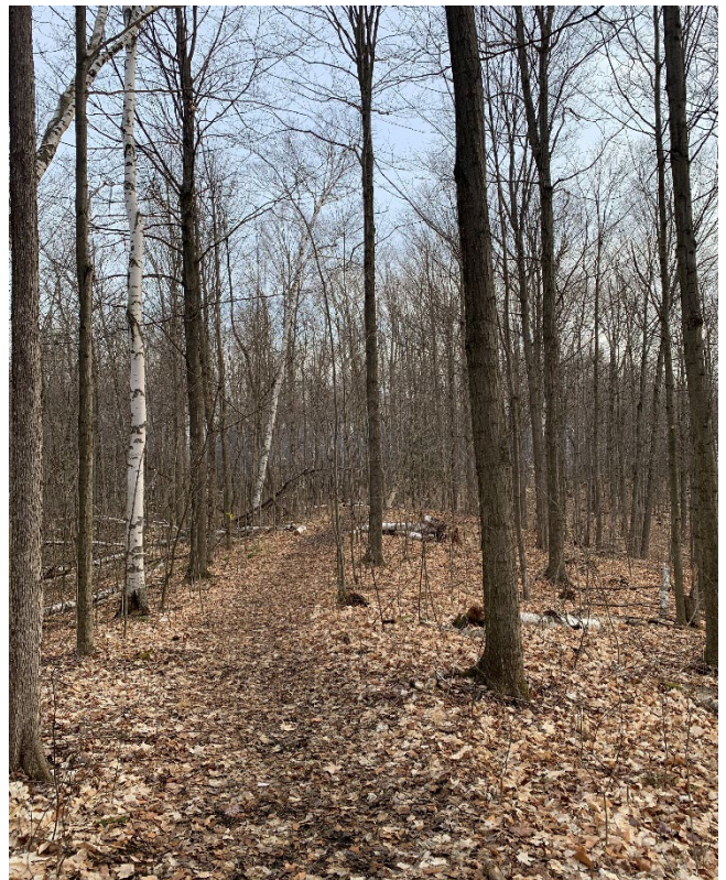
Grateful for all that the forest provides and appreciating the beauty of each season