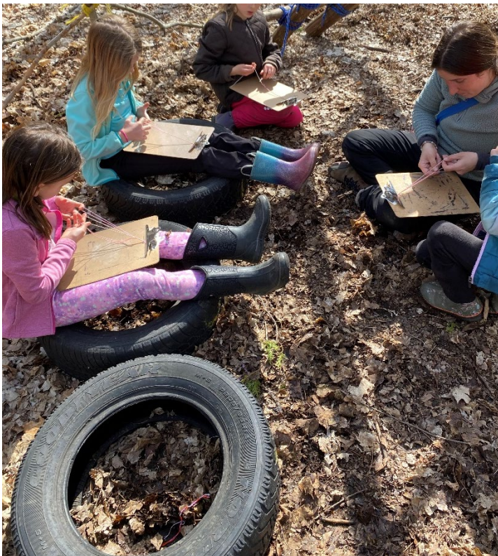
Bracelet making with embroidery string – a camper favourite