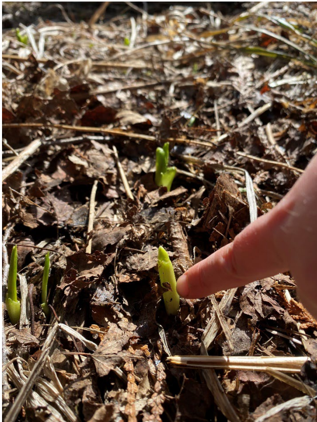
Oh hey little sprouts! Popping up earlier this year with all of these warmer weather