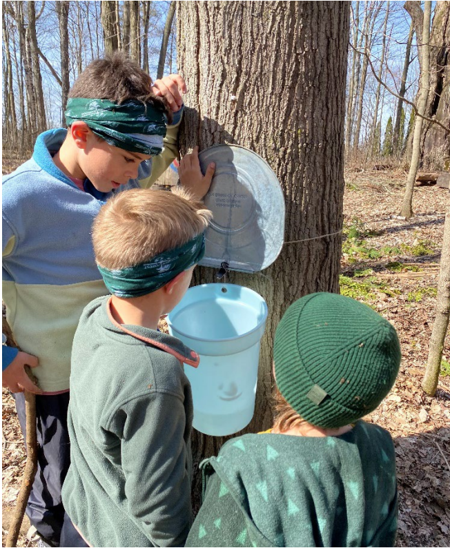
"Sap suckers" is a community job – checking buckets and collecting sap daily, sometimes twice!