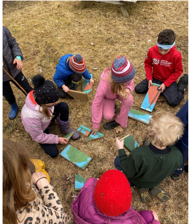
Working together to build a wooden puzzle that was a clue to where they would find Ember