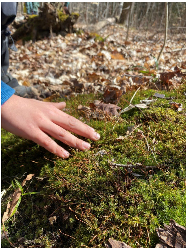
Feeling the softness of moss – the carpet of the forest and a cozy place for a nap!