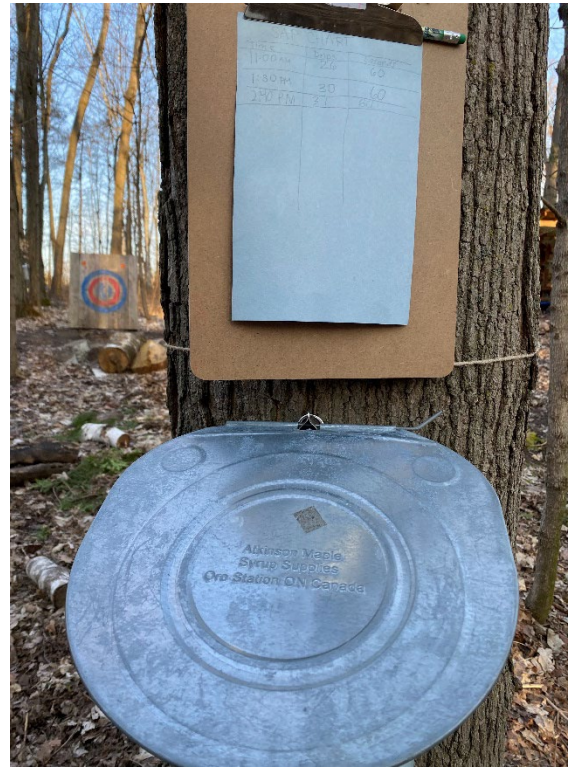
Measuring and recording daily flow rate of the sap