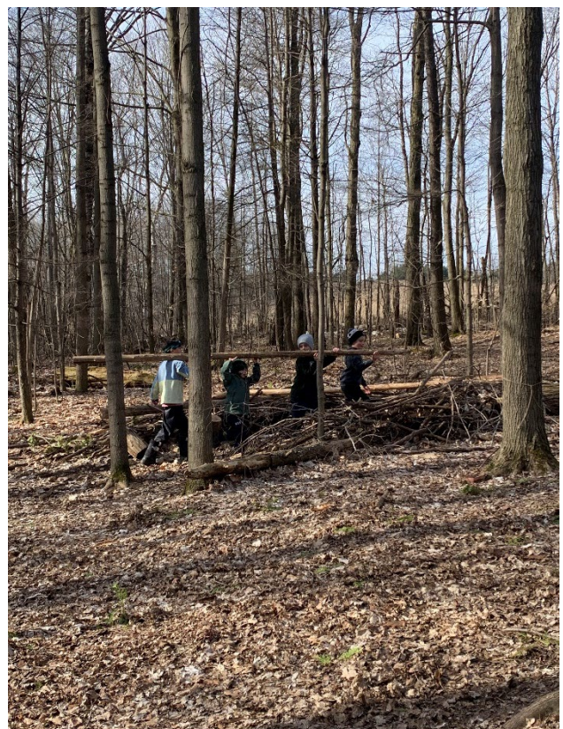
Teamwork makes the dreamwork! Working together to relocate a cedar branch