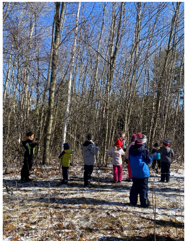
Practicing patience and stillness when feeding the chickadees